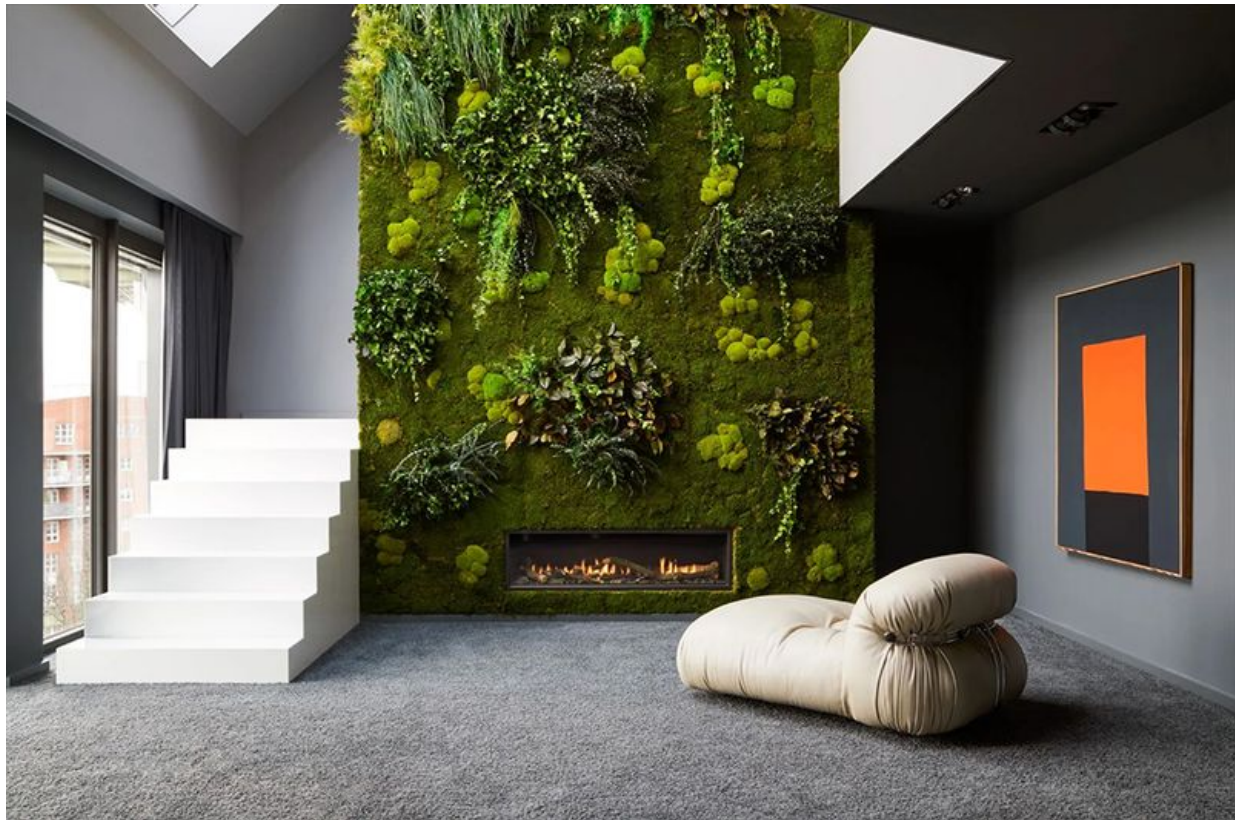
Dalí Decor: How to Curate a Surrealist Interior