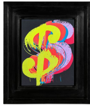
Contemporary Day Auction Featuring Andy Warhol