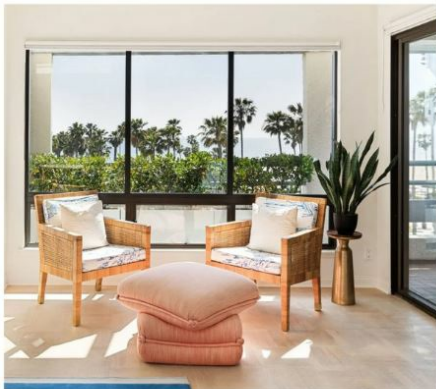
Homes with Delightful Coastal Design