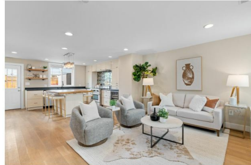
203 17th Street SE Hill East - $750,000 2 Beds, 2 Baths, 1,008 Sqft