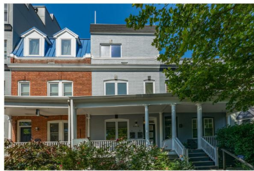
2315 Ontario Road Unit #2 Adams Morgan - $1,395,000 3 Beds, 4 Baths, 1,953 Sqft