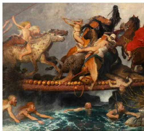
Old Master & 19th Century Paintings Evening Auction