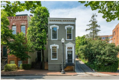
2439 P Street NW Georgetown - $1,275,000 2 Beds, 2 Baths, 1,207 Sqft