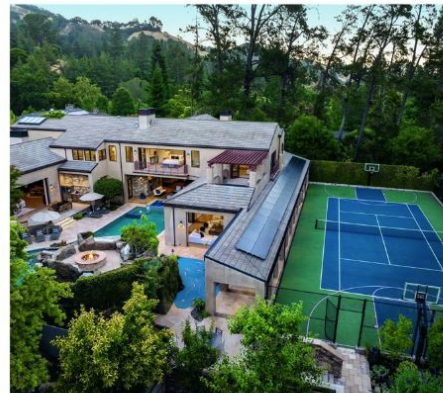
Homes Designed for Sports Lovers