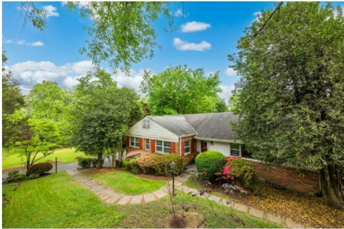
6627 Fletcher Lane McLean - $1,850,000 4 Beds, 3 Baths, 1885 Sqft