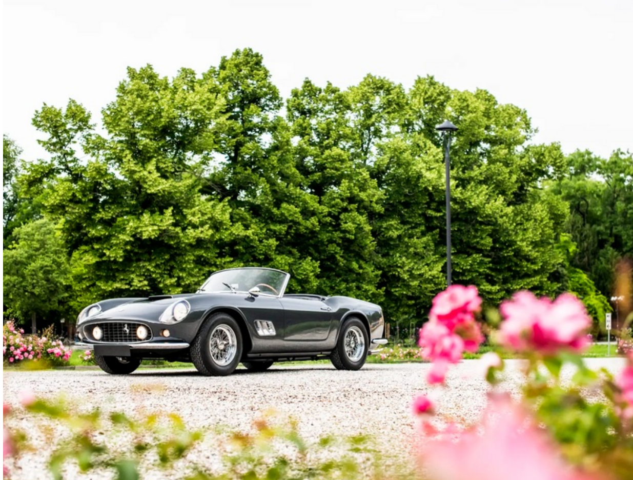
1960 Ferrari 250 GT SWB California Spider by Scaglietti