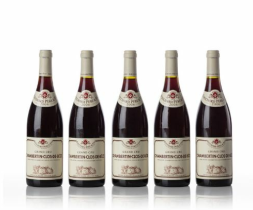
Vineyards of Distinction: Icons from a Noted Cellar