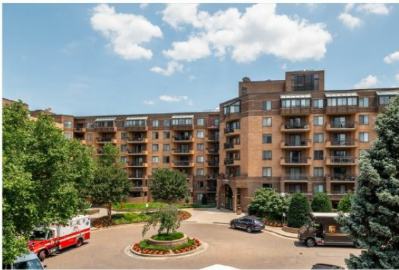
Georgetown | 2111 Wisconsin Ave NW PH1 $TBD - PRIVATE 2 Beds, 2.5 Baths, 1,663 Sqft