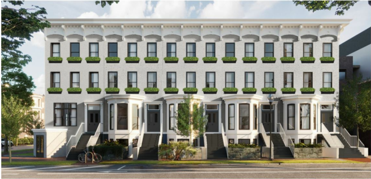
Location: Logan Circle, Washington DC ( Photo shows rendering of new development project: The Mayfair Residences )