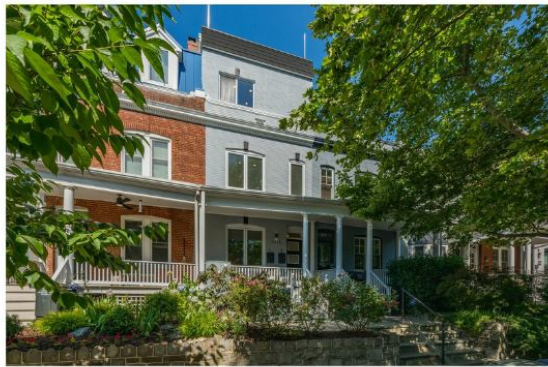
Adams Morgan | 2315 Ontario Rd Unit 2 $1,395,000 - ACTIVE 3 Beds, 4 Baths, 1,953 Sqft