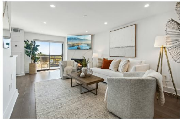
Georgetown | 2111 Wisconsin Ave PH8 $TBD - PRIVATE 2 Beds, 2.5 Baths, 1454 Sqft