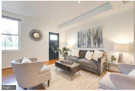
Navy Yard | 1014 3rd St $785,000 - UNDER CONTRACT 3 Beds, 2 Baths, 1,440 Sqft