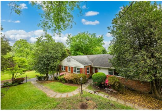
Mclean | 6627 Fletcher Lane $1,850,000 - PRIVATE 4 Beds, 3 Baths, 1,885 Sqft